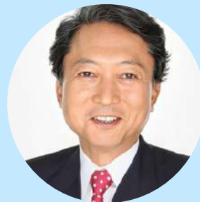
DR. YUKIO HATOYAMA

Co-founder of Apple, Founder of Efforce Energy Efficiency BlockChain