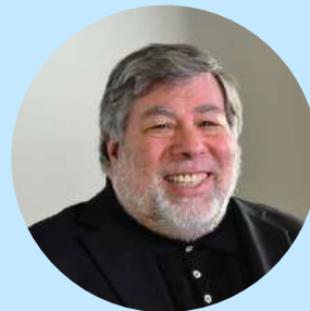
MR. STEVE WOZNIAK

Chairman of EverImpact, Former Under-Secretary- General of United Nations Member of the World Bank Group Inspection Panel